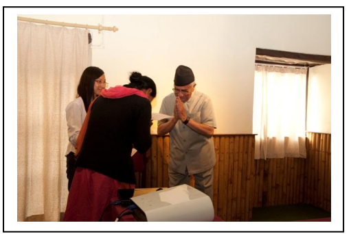
Page | 33