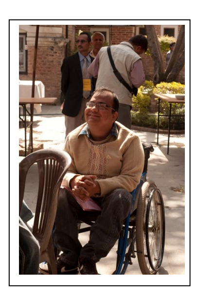
Figure 4: A participant from the conference