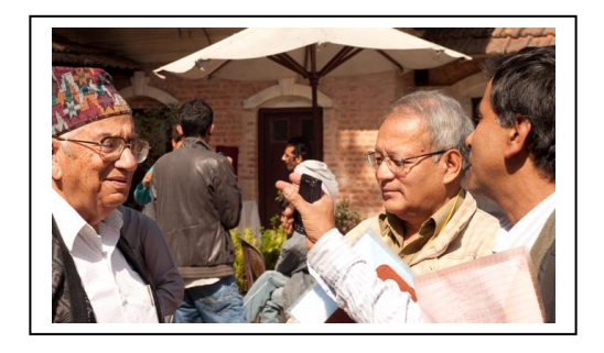
Figure 2: Participants at the registration session